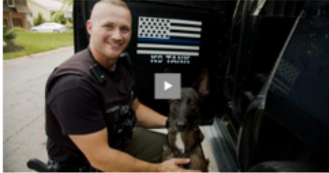
Going to the Dogs