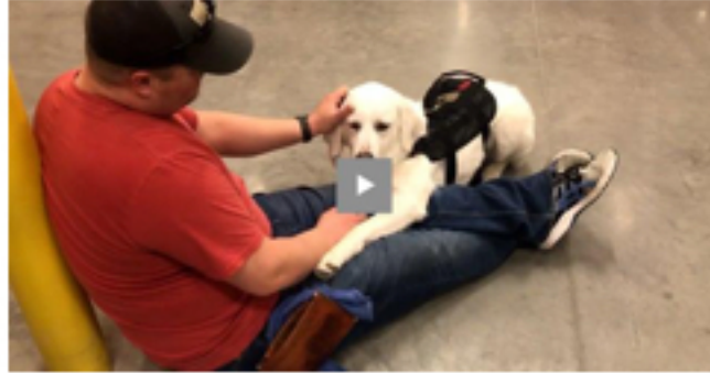
Warriors' Best Friend